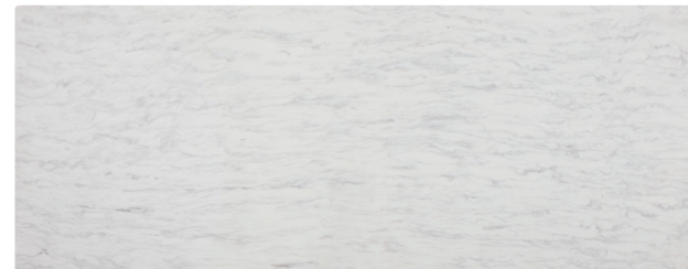
1200 mm slab shown