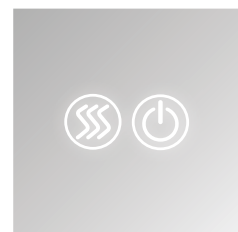
Touch sensors for light and demister